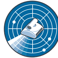
CleverClean™ scanning system