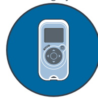
Remote control unit