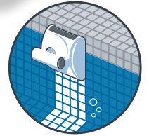
Walls & water line cleaning