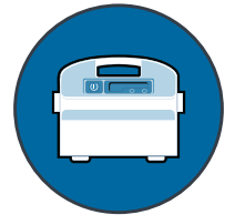
Full filter and operation delay indicators